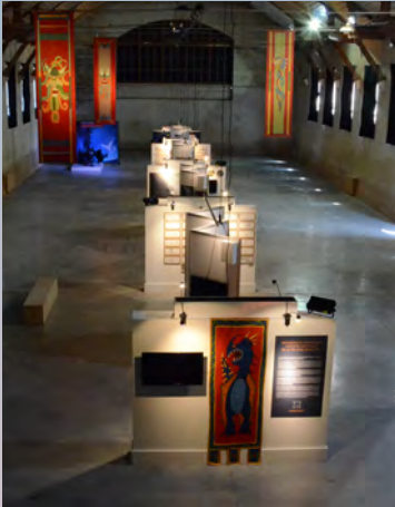
The Musée du cinéma d'animation